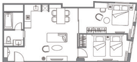
Two-Bedroom (64-74 sqm)