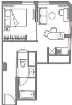
One-Bedroom Double (41-45 sqm)