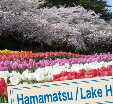
Hamamatsu / Lake Hamana