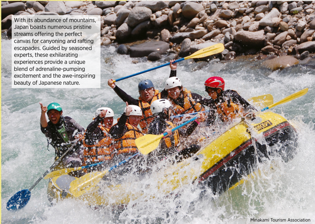
Minakami Tourism Association

With its abundance of mountains, Japan boasts numerous pristine streams offering the perfect canvas for canyoning and rafting escapades. Guided by seasoned experts, these exhilarating experiences provide a unique blend of adrenaline-pumping excitement and the awe-inspiring beauty of Japanese nature.