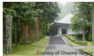
Konjikido (Golden Hall), Chusonji Temple (Hiraizumi)

■ = Cultural heritage sites ■ = Natural heritage sites