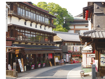
Naritasan Shinsho-ji Temple (Chiba) (ABOVE)

Meander along the enchanting Narita Omotesando shopping street to find Naritasan Shinsho-ji Temple, a sprawling complex dating back to A.D. 940, renowned for its impressive architecture, diverse events, and convenient proximity to Narita International Airport.