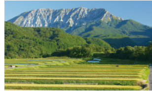
Daisen-Oki National Park