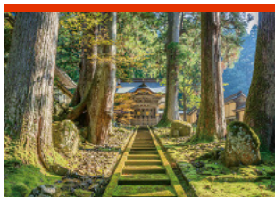
Daihonzan Eiheiji (Fukui)

Daihonzan Eiheiji, founded by Zen Master Dogen in 1244, is a solemn Soto Zen Monastery deep in the mountains of Fukui where about a hundred monks dedicate themselves to the practice of Zen.