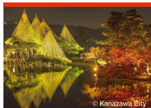
Kenrokuen Garden (Ishikawa)

A historic hot spring resort area just over an hour from Tokyo, Echigo Yuzawa offers a paradise for enthusiasts with 12 ski fields that benefit from an abundant and prolonged period of powder snow each year.