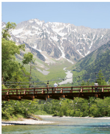
Kamikochi (Nagano) (ABOVE)

Situated at an altitude of 1,500 meters and part of a national park, Kamikochi invites exploration with the allure of both scenic strolls and more serious mountain treks, and includes multiple accommodation options.