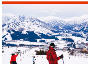
Echigo Yuzawa (Niigata)

Daihonzan Eiheiji, founded by Zen Master Dogen in 1244, is a solemn Soto Zen Monastery deep in the mountains of Fukui where about a hundred monks dedicate themselves to the practice of Zen.