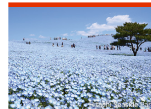
Hitachi Seaside Park (Ibaraki)

Kamakura, just an hour from Tokyo, captivates with historic temples, including the iconic Great Buddha, and famous cherry blossom spots. Experience the many shops along the approach to Tsurugaoka Hachimangu Shrine in this ancient capital.