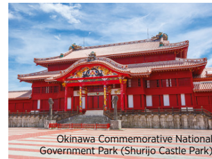
Okinawa Commemorative National Government Park (Shurijo Castle Park)