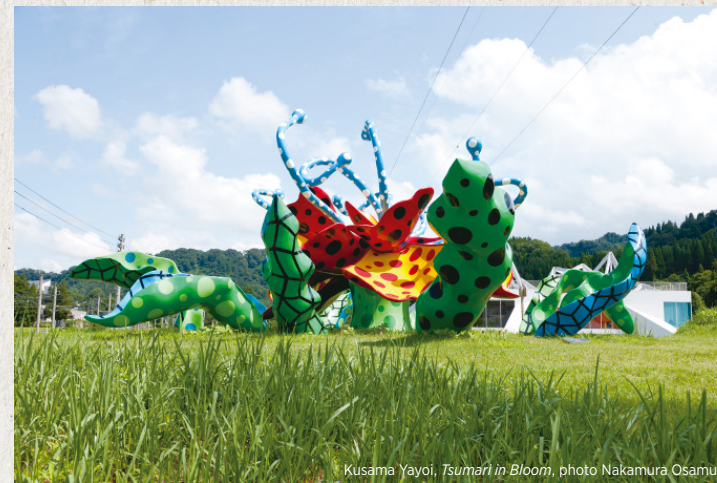
Kusama Yayoi, Tsumari in Bloom

This park is designed to capture the hearts of fans globally by bringing to life the world of Studio Ghibli. Wander through five distinct areas set amidst beautiful natural surroundings. Tickets are available by reservation only.